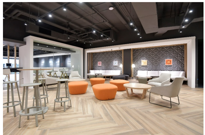
LeaLea Lounge at Royal Hawaiian Center

The newly renovated lounge at Royal Hawaiian Center is the first Hawaii Tourism Japan (HTJ hereafter) Satellite Office in Hawaii, officially certified on December 2. This certification is given only to travel agencies, shops, and restaurants if over 50% of its staff has passed the advanced Hawaii Specialist examination (Hāpuu) of “Aloha Program,” the HTJ official learning site.