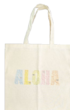
LeaLea Original Tote Bag

Since establishing HIS Hawaii in 1991, the company has strived to have its customers enjoy Hawaiian nature, culture, and history, integrating into the tourism industry to revitalize the local economy. Through LeaLea Lounge, HIS aims to provide unforgettable and exclusive experiences for all customers visiting Hawaii.