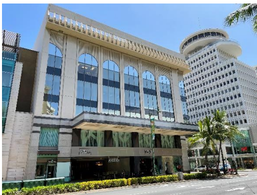
Waikiki Shopping Plaza