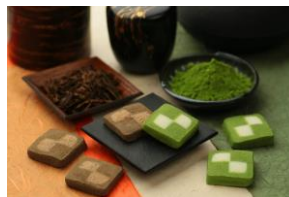
“Yaki Chocolate” / $8.49 BIJUU