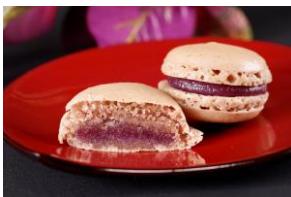
“Kyo Macaron” / $14.49- MUTSUMI SEIKA

Honolulu, Hawaii, MARCH 14, 2024 – Hawaii HIS Corporation (“HIS Hawaii”) will hold “Kyoto Fair” from April 1-30, 2024 at HIS Hawaii Ala Moana Branch located near Centerstage on the first floor of Ala Moana Center, Hawaii’s largest shopping mall. The event will introduce the charm and fine culture of Kyoto, along with about 30 Japanese confectioneries and rice snacks from 13 brands, to local residents and tourists from outside of Hawaii. At the same time, the event aims to generate interest to travels to Kyoto and Japan.