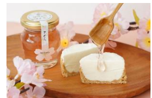
“Sakura Honey” / $13.39 MIEL MIE

Formerly located next to Don Quijote on Kaheka Street, HIS Hawaii moved to Ala Moana in the fall of 2021 in search of a larger retail space. Ever since then, the Ala Moana Branch has served as our flagship store not only to provide travel services, but also to introduce unique products from across Japan so that Hawaii residents can easily feel the country’s culture and learn about various regional destinations.